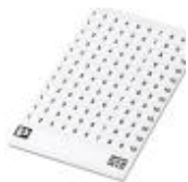
Marker card, Card, white, labeled, Horizontal: Consecutive numbers 1 - 10, 11 - 20, etc. up to 91 - (99)100, Mounting type: Adhesive, for terminal block width: 5 mm, Lettering field: 5 x 3.8 mm

Marker card - SK 5/3,8:FORTL.ZAHLEN - 0804183